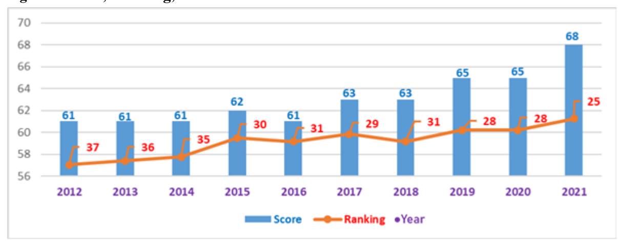
Figure 3 Score, Ranking, and Trend Chart of Taiwan's CPI between 2012 and 2021

24. According to the Corruption Perceptions Index (CPI) published annually by Transparency International, Taiwan's score ranged from 61 to 68 (out of 100) and ranking ranged from 37<sup>th</sup> to 25<sup>th</sup> for the years 2012 to 2021. After the Act to Implement UNCAC took effect in 2015, the score steadily increased from 62 to 68, and the ranking also improved from 30<sup>th</sup> to 25<sup>th</sup>, showing a better result than those in the years before the Act took effect (as shown in Figure 3). In 2021, Taiwan's ranking and score exceeded that of 86% of the countries in the world, ranking 6<sup>th</sup> in the Asia-Pacific region<sup>10</sup> and maintaining the best score in recent years.